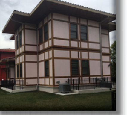
Open Education Bureau in Lanham, US