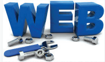
Associate Degree Program in Web Design and Coding