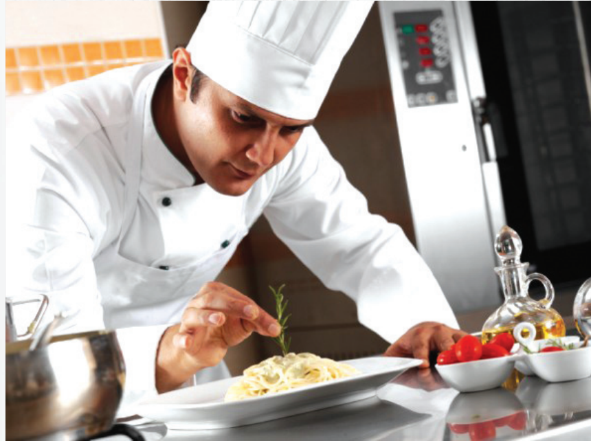
Associate Degree Program in Culinary Arts